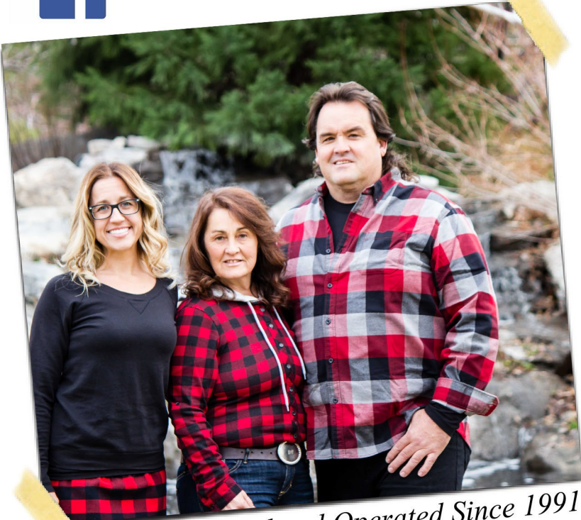
Family Owned and Operated Since 1991